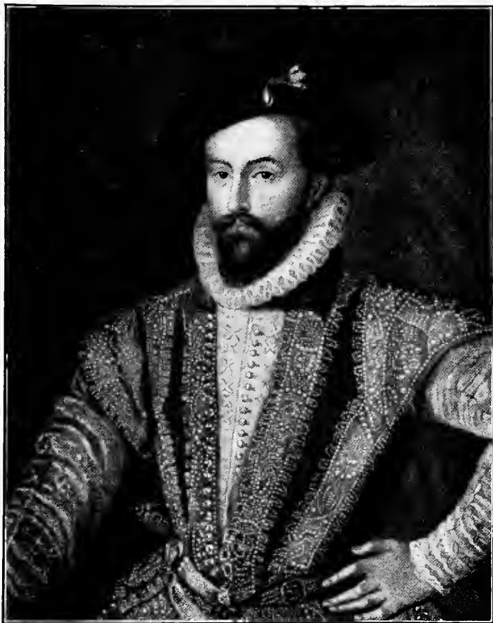
SIR WALTER RALEIGH

From a Painting in the Collection of the Duchess of Dorset